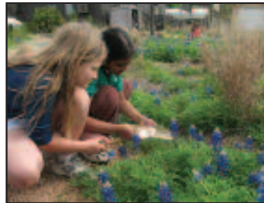
WaterSmart Demonstration School Habitat Lab, Environmental Institute of Houston on the campus of University of Houston at Clear Lake.

► Texas: Under the direction of TX NEMO, a WaterSmart Demonstration School Habitat Lab was installed at the Environmental Institute of Houston on the campus of the University of Houston at Clear Lake as a means of creating a habitat for wildlife that also functions as an instructional lab for teachers, students and the community. The landscape provides a safe, accessible area to