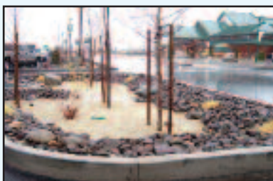
Cabela's retail store in Verdi, Nevada installed bioretention islands in their parking lots.