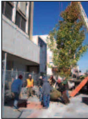
The city of Reno, Nevada installed four tree filter boxes as part of their downtown renovation project.