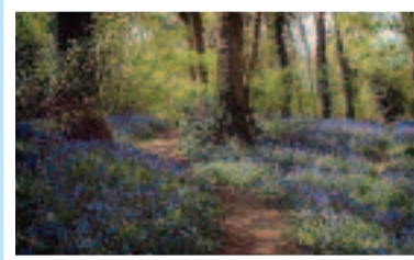
The town of Ogunquit acquired 1.5 acres of forest and wetland property abutting the Josias River. This piece of land has been developed into the Josias River Public Park.

While this was going on, the conservation commission located three large contiguous tracts, totaling about 100 acres, about 1.5 miles from downtown Ogunquit. Private parties own two and the other is town land. The private land owners have committed to the conservation commission to place conservation easements on the parcels.