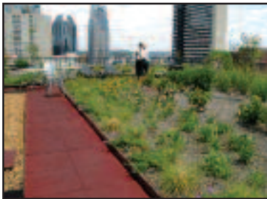
A green roof demonstration project in downtown Nashville, Tennessee.

coming to a close, each municipality has allocated funds to maintain the program, with funding for a full time wastewater manager in each community. RI NEMO has provided education and technical support to the towns in setting up these programs.