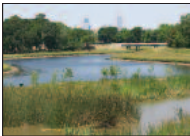
A constructed wetland along the Brays Bayou in Houston, Texas.

first documented proof of the effectiveness of this method in the Houston region. This wetland consistently removes nearly 99 percent of the bacteria in the stormwater inflow. The project won several national and state awards and serves as a demonstration of how wetlands can be incorporated into drainage infrastructure.