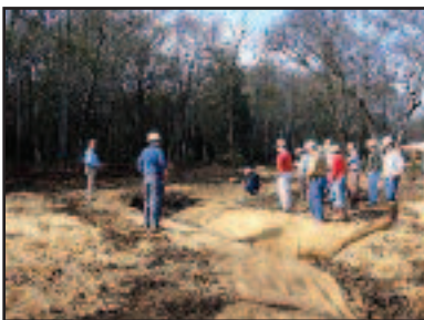
AL NEMO is helping restore streams in the city of Auburn.

► Alabama: AL NEMO, Alabama Cooperative Extension System, ADEM, U.S. EPA Region 4, North Carolina State University and USDA CSREES Southern Regional Water Program worked with the city of Auburn and other partners to conduct a series of workshops on stream restoration that corresponded to the planning, design and construction of a restored stream. Five workshops were completed in 2007 - 2008 that trained over 200 professionals from across the Southeast. Additionally, 1000 feet of stream were restored in a city of Auburn