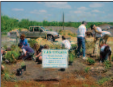
Students help plant the Yarborough Elementary School Rain Garden in the city of Auburn.

The goal of changes to local plans and regulations is to open the door for tangible, on the ground changes to the way development happens or doesn't happen. This category of impacts includes everything from the conservation of critical natural areas to the application of low impact development and other techniques to a new or retrofit development.